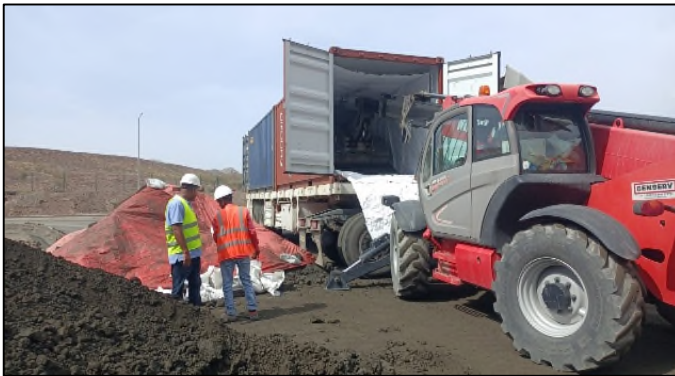
Images: Loading copper concentrate shipment for delivery to Sohar Port

Improvements in the floatation circuit at the plant resulted in a notable increase in both process efficiency and production levels in the first shipping cycle since those works were completed. 186 metric tons (MT) of copper metal was produced over the sixth, two-week, shipping cycle, compared to 124 MT copper produced in the fourth, four-week, cycle. (This comparison omits the fifth shipping cycle, which was extended due to a plant shutdown for improvements to the tailing filter press).