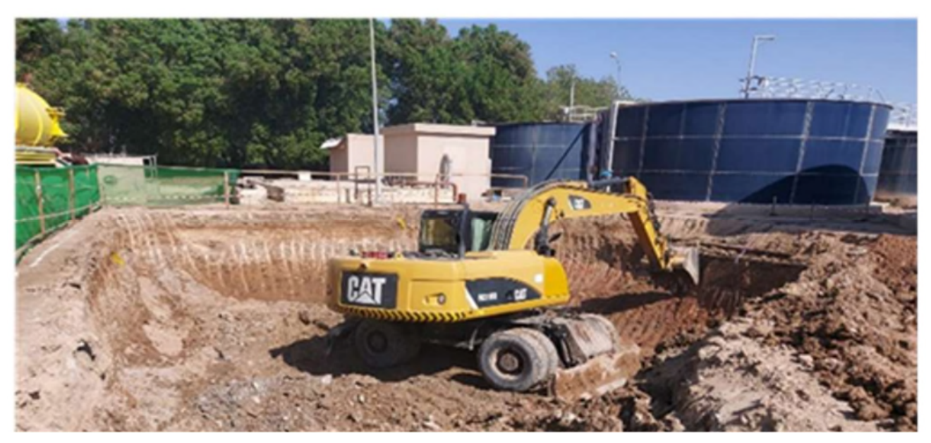
Figure 5: Tank excavation works at the Haya Water site

These works are being carried out in fulfillment of an agreement between AL Hadeetha Resources LLC and Oman Water & Wastewater Services Company SAOC ( OWWSC ) which secures the critical process water supply for the duration of the Al Wash-hi Majaza Copper-Gold Project. Key highlights of the agreement are: