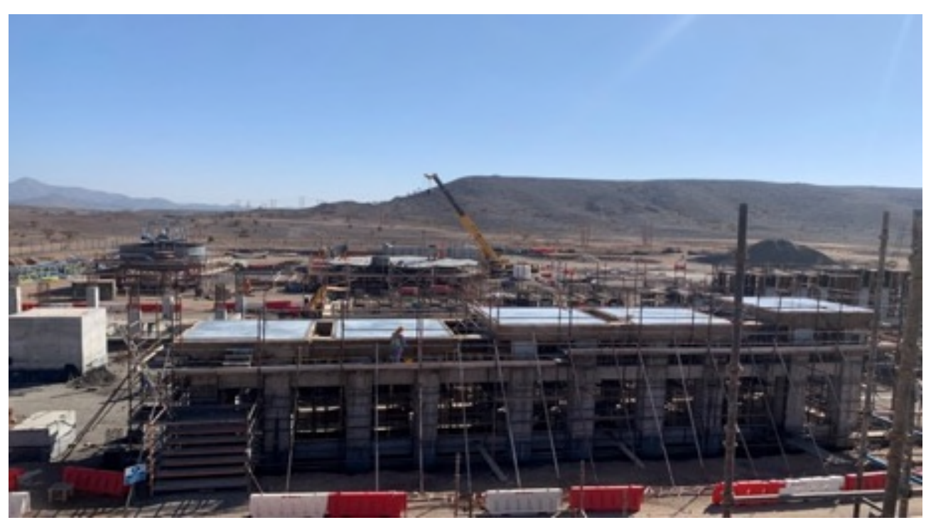
Figure 2: Flotation bay