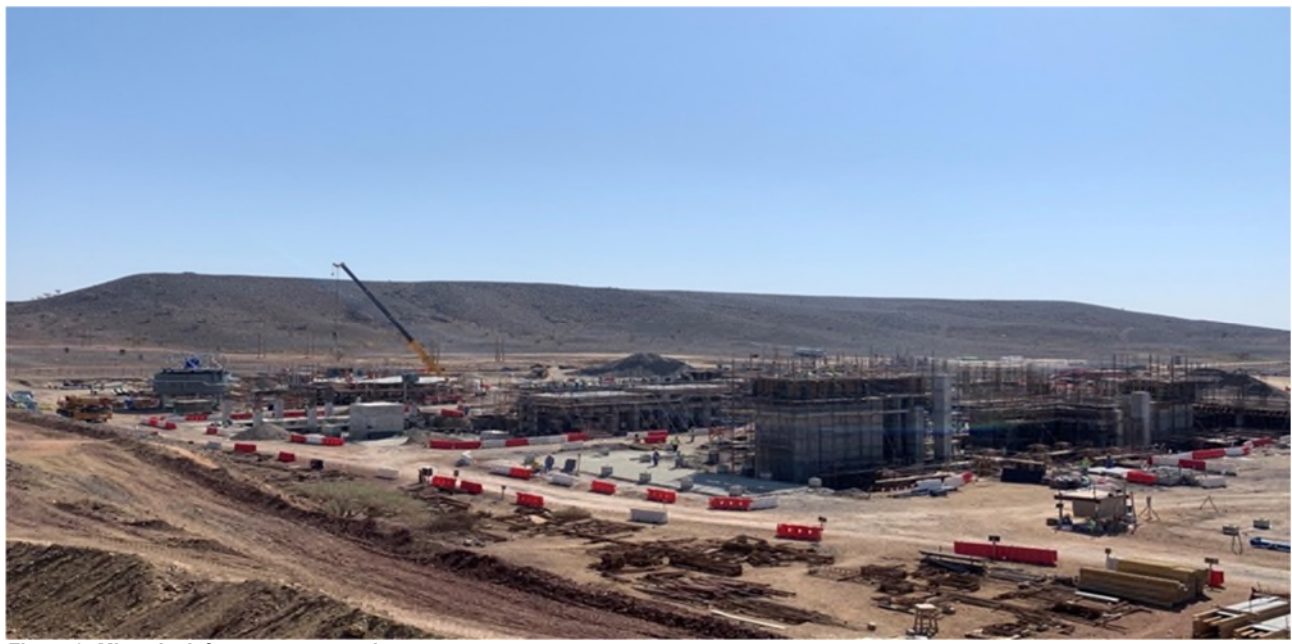
Figure 3: Mine site infrastructure overview

Key Project works completed in the reporting period included: