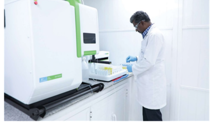
Figure 6: Exterior and interior of onsite laboratory