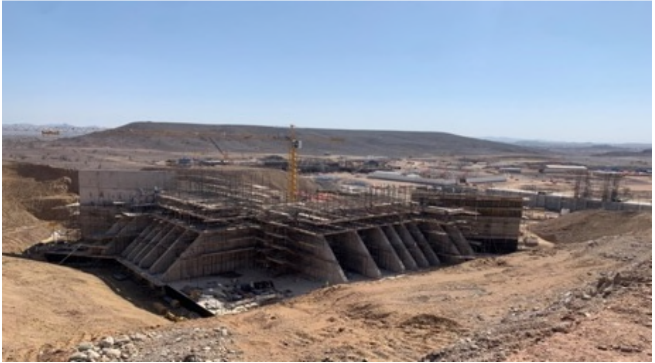
Figure 1: Retention wall and primary crusher

The following images depict progress made in the Project construction phase during the reporting period and to February 2023.