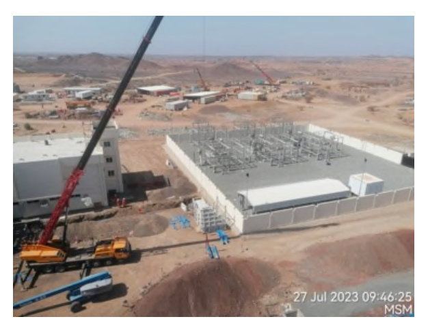
Construction of Electricity Substation

Construction works for the 33KV electricity substation are complete, including poles and cabling. The substation will be energised just ahead of plant commissioning.