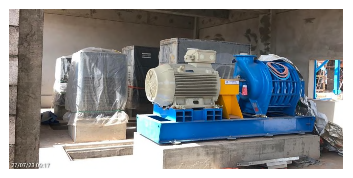
Blowers & Compressors