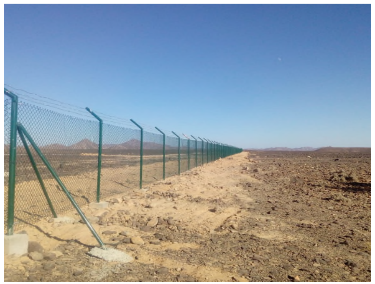
Northern Mine-Site Fencing

Fencing along the northern border of the mining license boundary was also installed during the period.